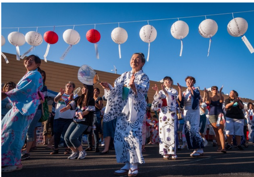
Leading Bon Odori at OBT, 2011.