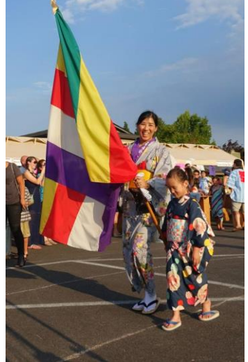
Earning their BCA Scouting Obon Patch and leading the Obon dancers.