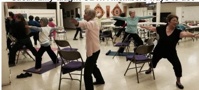
Yoga to help them in their daily movements to prevent falls and other problems that arise with aging.